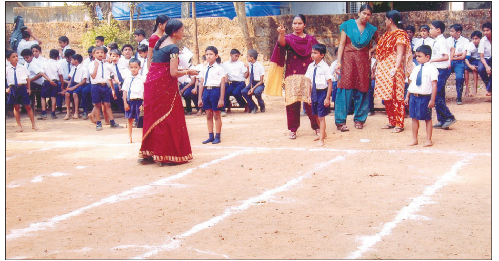
Teachers arranged the students in the primary section sports

curious to participate. The spirits of the students was at a peak. Many teachers were arranged each of the item for maintaining and for judging the winners. After the eventful day, results were announced and accordingly Beta got 1 st place with 135 points and Alpha got 2 nd place with 115 points. Certificates and medals were distributed on that day itself. Gold medals for 1 st place and Silver medals for 2 nd . place were distributed to the respective winners. Refreshment were provided for participants. The events continued till 6'o' clock in the evening.